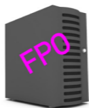
ABC Product (Model) Name

*Please refer to NVIDIA documentation for what is currently supported.